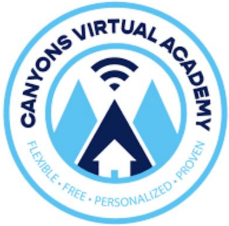
Canyons Virtual Academy